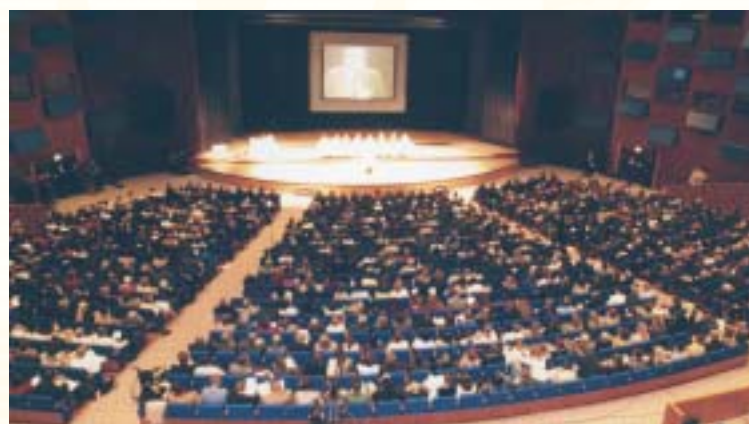
50th anniversary of the Congress of Europe in The Hague (1998)