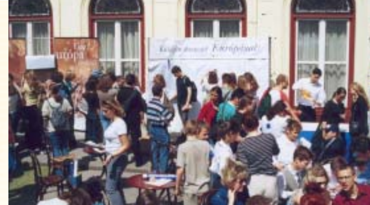
Send a message to Europe in Budapest (2002)