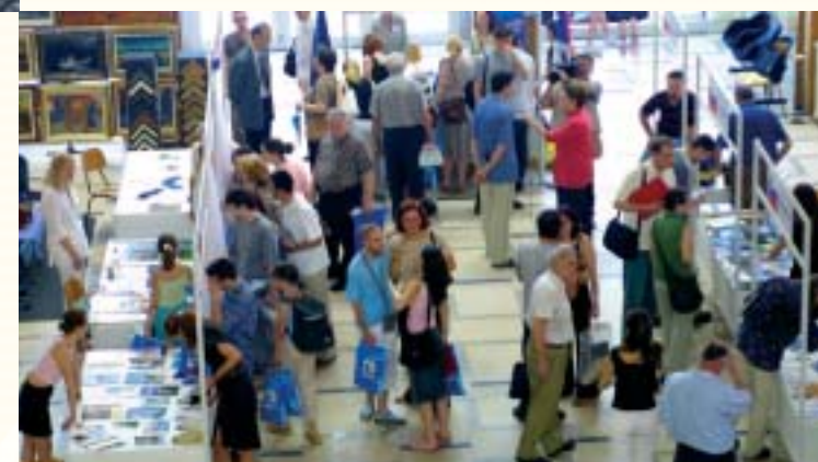
School competition in Serbia (2003)