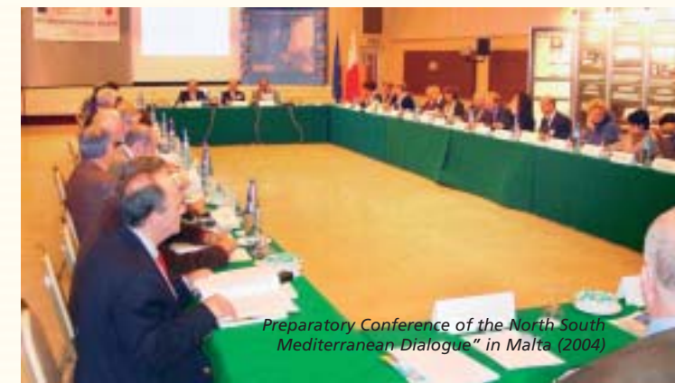
Preparatory Conference of the North South Mediterranean Dialogue in Malta (2004)

The EMI Training Academy provides courses/seminars on European policy making and public affairs, explaining the EU – its institutions, its legal system and procedures, its policies and its role as a global actor. Professionals, civil servants, businessmen and young graduates learn from European practitioners and academics, gaining a practical insight into who does what and how in the European institutions.