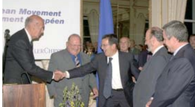
EMI reception in honour of the members of the Convention in Brussels (2002)