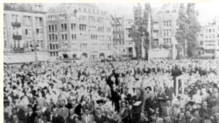
Congress of Europe in The Hague (1948)